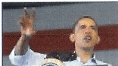
Obama asks students to set school-year goals