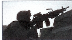
Blog: Audio slideshow of tattoos in the U.S. Army