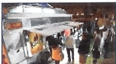
Food truck dinner date during the recession